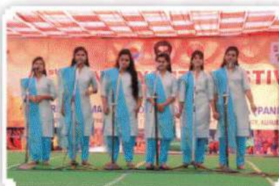
Students participating in 41 Zonal Youth Festival