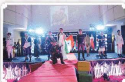
Students participating in the Fashion Show being organised in the College