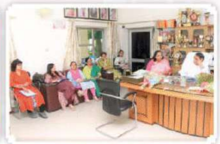
The Annual IQAC Meeting