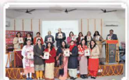
Release of Abstract Booklet at the International Seminar