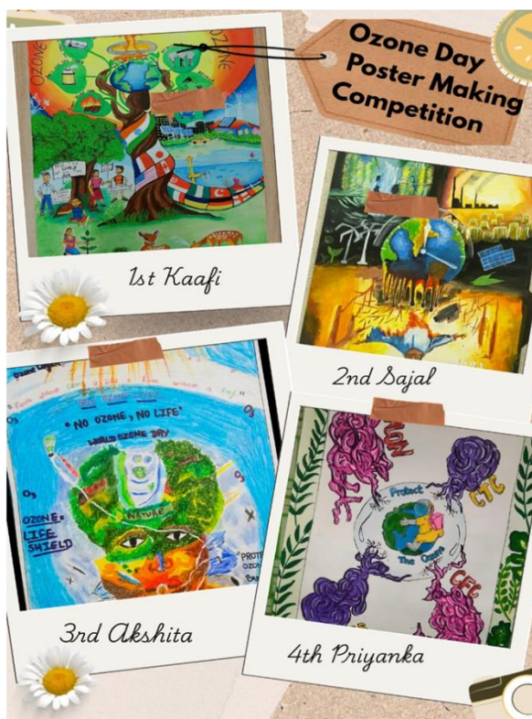
Results of State Level Online Poster Making and Essay Writing Competitions (Left) and a display of selected posters (Right)