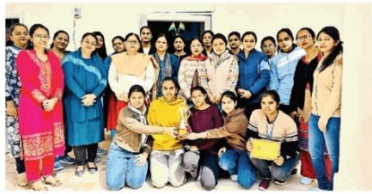
कन्यालय में केवीए डीएवी महिला कालेज की विजेता छात्रा छात्राओं के साथ।