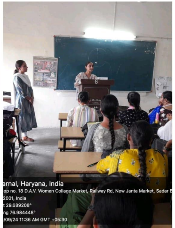
Karnal, Haryana, India Railway Road, MXQM+PQQ, near Govt. Sr. Sec. School, New Janta Market, Sadar Bazar, Karnal, Haryana 130001, India Phone: +91 98102 29.689208° Phone: +91 98102 76.984448° Date: 16/09/24 11:36 AM GMT +05:30