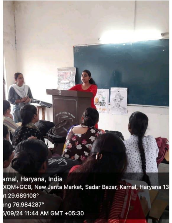
Karnal, Haryana, India Railway Road, MXQM+PQQ, near Govt. Sr. Sec. School, New Janta Market, Sadar Bazar, Karnal, Haryana 130001, India Phone: +91 98102 29.689108° Phone: +91 98102 76.984287° Date: 16/09/24 11:44 AM GMT +05:30