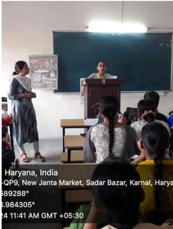
Haryana, India MXQM+PQQ9, New Janta Market, Sadar Bazar, Karnal, Haryana, 32001, India Lat 29.689288° Long 76.984305° 06/09/24 11:41 AM GMT +05:30