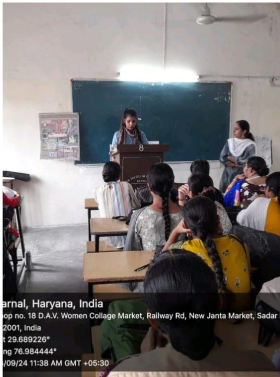
Karnal, Haryana, India Railway Road, MXQM+PQQ, near Govt. Sr. Sec. School, New Janta Market, Sadar Bazar, Karnal, Haryana 130001, India Phone: +91 98102 29.689226° Phone: +91 98102 76.984444° Date: 16/09/24 11:38 AM GMT +05:30