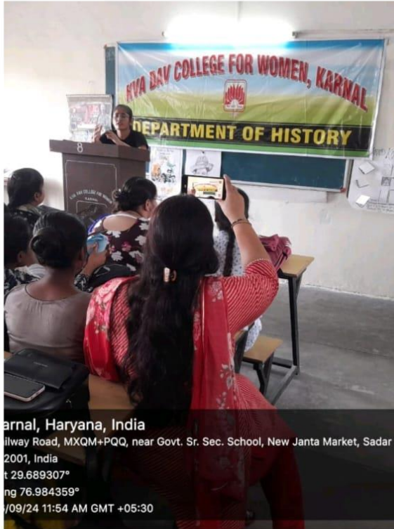
Karnal, Haryana, India Railway Road, MXQM+PQQ, near Govt. Sr. Sec. School, New Janta Market, Sadar Bazar, Karnal, Haryana 130001, India Phone: +91 98102 29.689307° Phone: +91 98102 76.984359° Date: 16/09/24 11:54 AM GMT +05:30