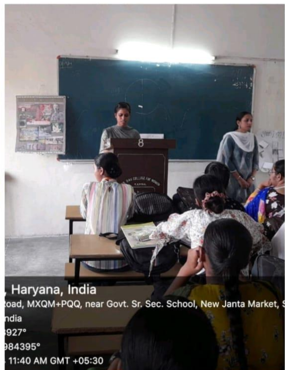
Haryana, India Railway Road, MXQM+PQQ, near Govt. Sr. Sec. School, New Janta Market, S 32001, India Lat 29.68927° Long 76.984395° 06/09/24 11:40 AM GMT +05:30