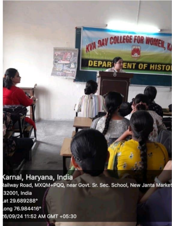
Karnal, Haryana, India Railway Road, MXQM+PQQ, near Govt. Sr. Sec. School, New Janta Market, 32001, India Lat 29.689288° Long 76.984416° 06/09/24 11:52 AM GMT +05:30