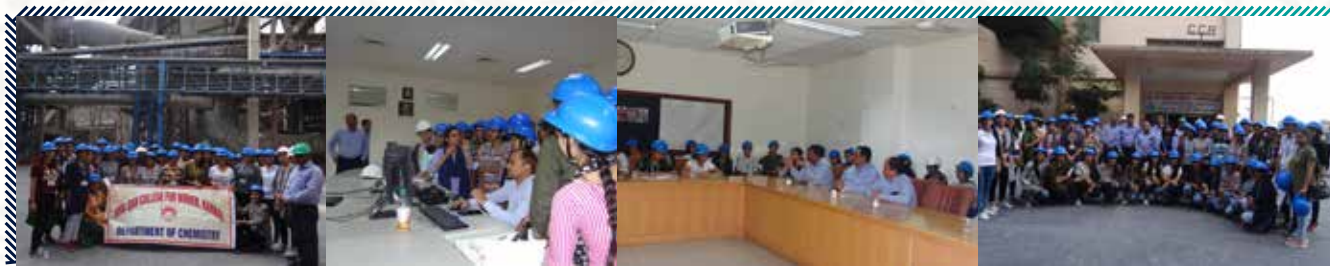
Workshop on Cement Industry on September 19, 2019