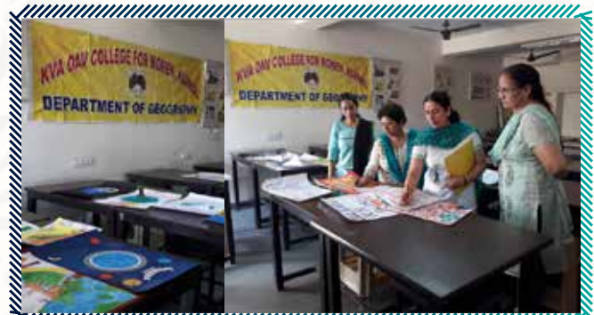
Poster Making Competition held during Ozone Day Celebrations on September 16, 2019