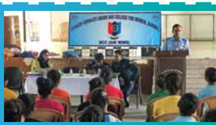
Enrolment for First Year Cadets held on August 07, 2019