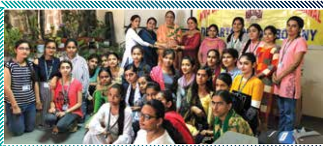
Potted Plant Competition on August 09, 2019