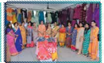
"Jashn-e-Diwali", October 18, 2019