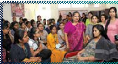
Regional Workshop on "Smoothing and Colour Highlights" on September 26, 2019