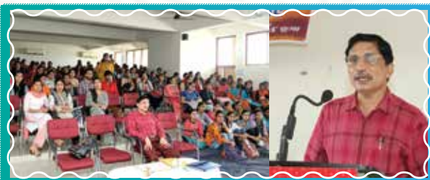
कार्यक्रम में उपस्थित छात्राएं