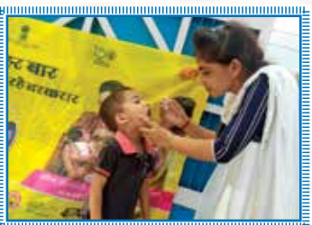
Students participating in "Pulse Polio Abhiyan"