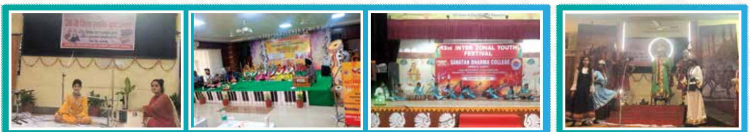
Classical Vocal (Solo)

42 nd Inter Zonal Youth Festival November 07-09, 2019