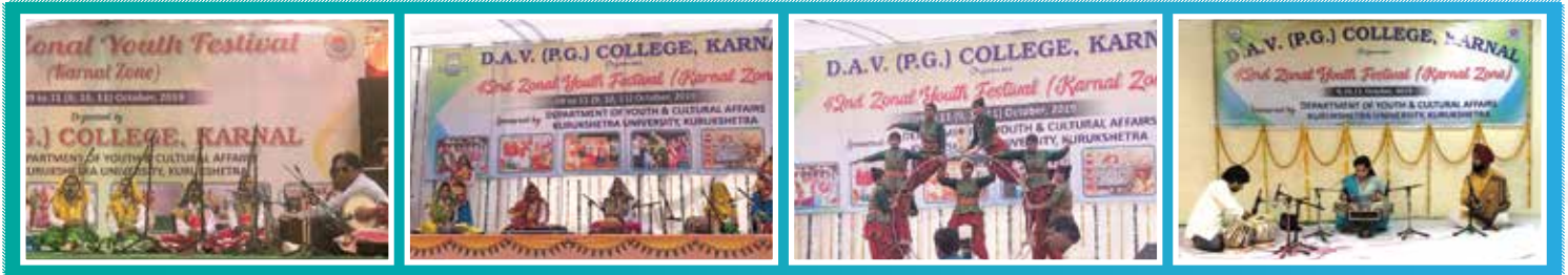
Students participating in Haryanavi Group Song

42 nd Zonal Youth Festival October 09-11, 2019