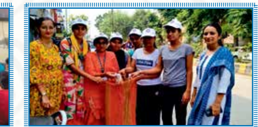
Volunteers collecting plastic waste