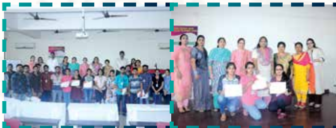
State Level Quiz Contest on 'Wildlife' on September 27, 2019