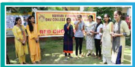
National Deworming Day was celebrated on August 08, 2019 by distributing medicines to students by the Red Cross Volunteers