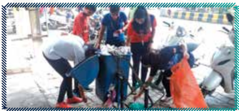
Plogging on Gandhi Jayanti under Fit India Movement on October 02, 2019