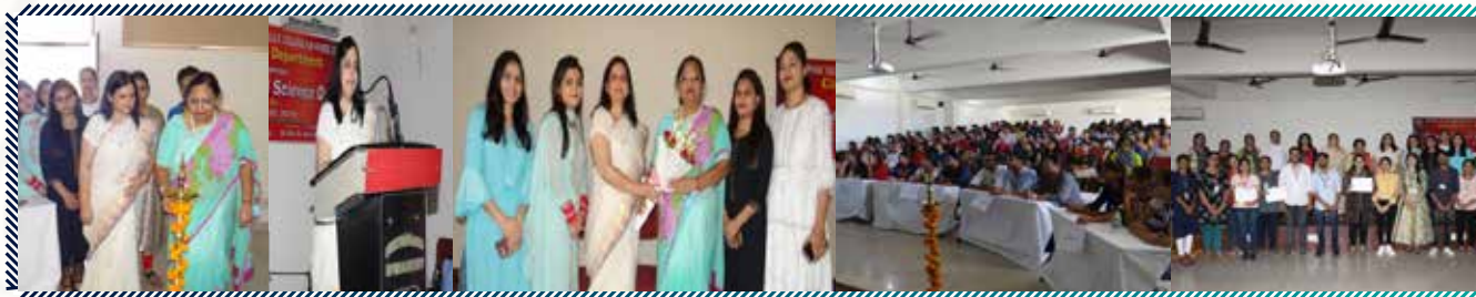
State- Level Science Quiz Competition on September 20, 2019