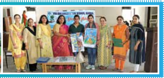
Painting Competition on "Water Conservation"