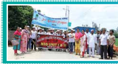
Rally at Village Uchani