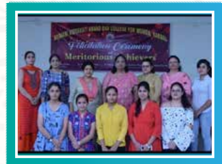
Merit holders of M.Sc. Biotech., in Felicitation Ceremony