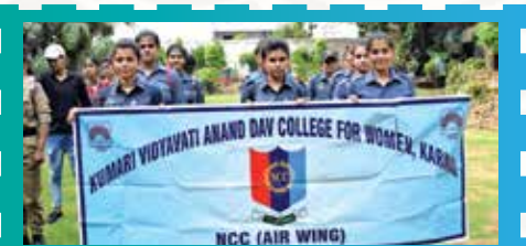
Cadets participating in a Rally on 'Cleanliness' on October 01, 2019 as a part of "Swachh Bharat Abhiyan"