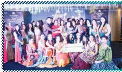
Students of B.Voc. FT and B.Sc. FD won 1 st Prize in Inter State Fashion Show by JCI on September 13, 2019