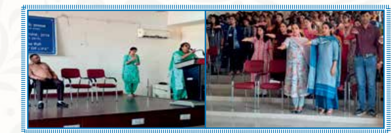
Vigilance Awareness Week, October 28 to November 02, 2019