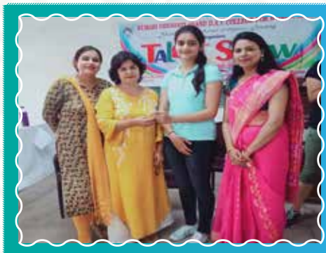
A Quiz Contest conducted under the banner of Youth and Cultural Affairs Society on August 29, 2019