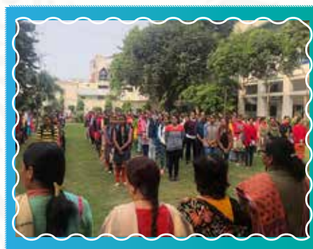
Students and teachers took oath of Preamble of Constitution