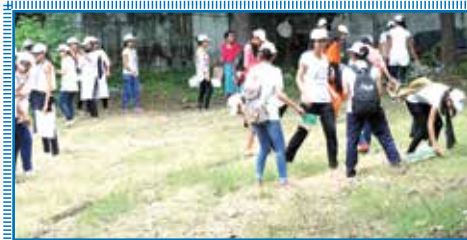
Cleanliness at the hospital and dispensary of LUVAS Regional Centre, Karnal

Swachhta Pakhwada from August 01 to 15, 2019