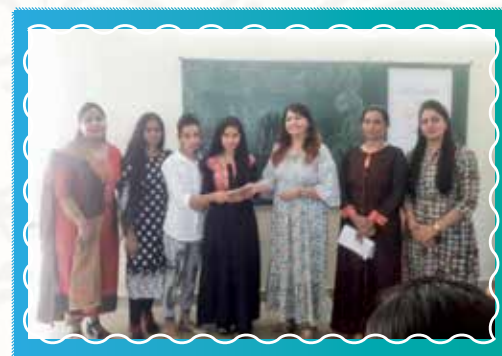
Ad-Mad Show organized for B.Com. (ASPSM) and M.Com. students on October 12, 2019