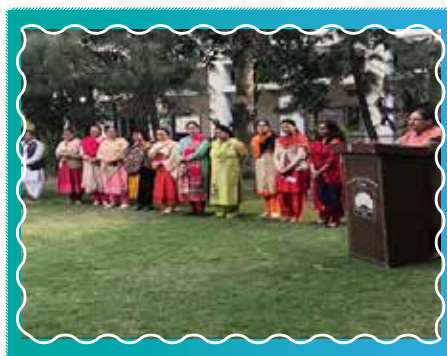
Celebrated Constitution Day on November 26, 2019