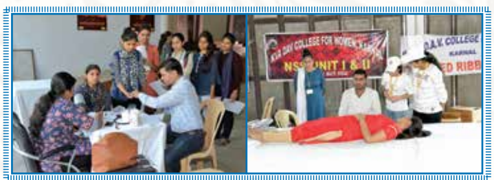
Blood Donation Camp, October 10, 2019