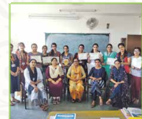
Students at Powerpoint Presentation on the topic "Nanotechnology" at IB College Panipat on September 07, 2019