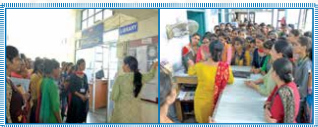
Orientation Programme on September 06-07, 2019