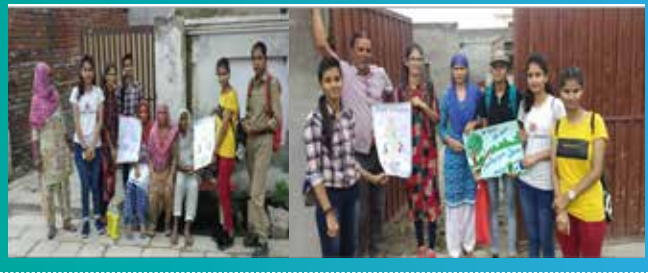
Cadets motivating the people of Ghogripur village for keeping their surroundings clean