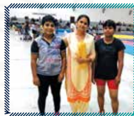
Winners of KUK Inter-College Wrestling Championship October 03-04, 2019