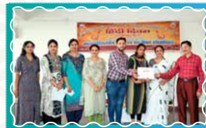
विजेता टीम को सम्मानित करते हुए मुख्य अतिथि एवं हिंदी विभाग