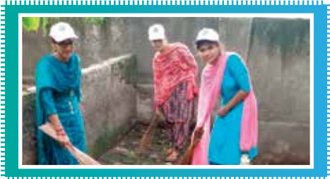
Swachh Bharat Summer Intership (SBSI) 2.0, June 10 to July 31, 2019

Jal Shakti Abhiyan, July 01 to September 15, 2019