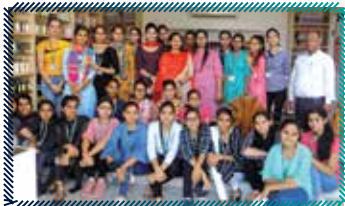
Industrial visit to Gayatari Khadi Gram Udyog Sangh on October 05, 2019