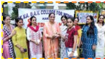
Deworming Day celebration on August 08, 2019