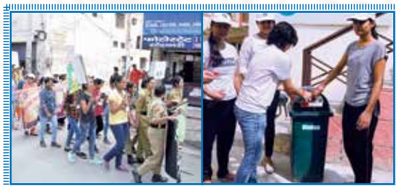
Swachhta hi Seva September 11 to October 02, 2019

150 th Birth Anniversary of Mahatma Gandhi