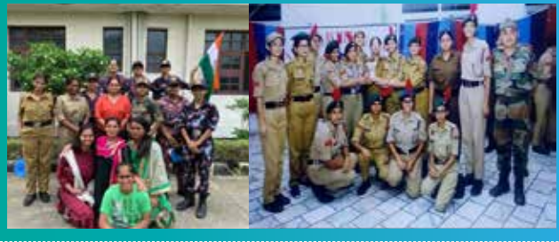
Winners of Skit Competition during ATC-149 at GIMT Kanipla, Kurukshetra