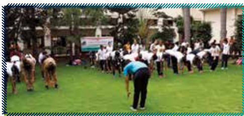
Fit India Movement on National Sports Day August 29, 2019