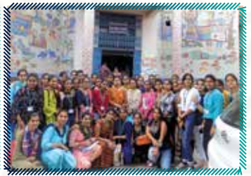
Students at Weaver Service Centre, Panipat on September 24, 2019