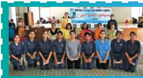
Cadets with Principal Ma'am after performing a skit on "Water Conservation" as a part of "Jal Shakti Abhiyan" on August 01, 2019