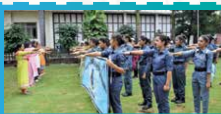
Cadets taking Pledge for 'Cleanliness' on October 01, 2019 as a part of "Swachh Bharat Abhiyan"