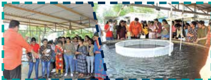
Visit to Sultan Fish Farm, Nilokheri on August 01, 2019