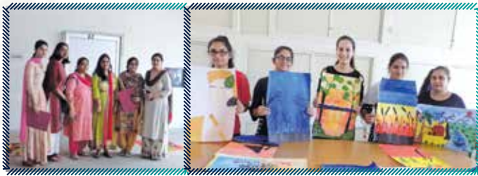
Students at Talent Hunt on August 29, 2019