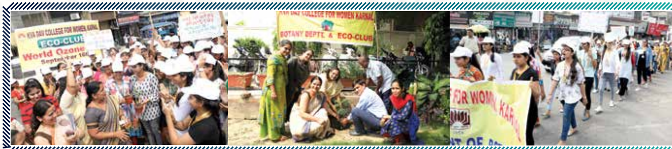
World Ozone Day on September 16, 2019