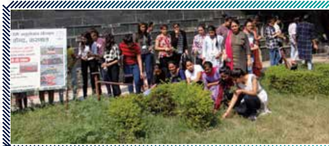
Plant Collection Trip on October 12, 2019