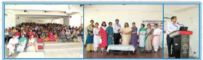
Workshop on "Usage of E-resources" on September 16, 2019