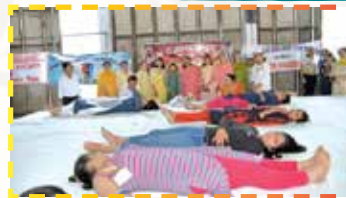
Blood Donation Camp on October 10, 2019