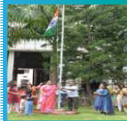
Flag hoisting on Independence Day