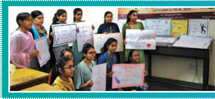
Poshan Maah, September 01-30, 2019