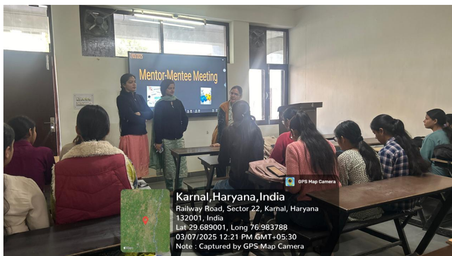
Mentor-Mentee Meeting held on March 07, 2025