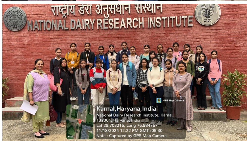
One Day Educational Visit to NDRI, Karnal on November 18, 2024.