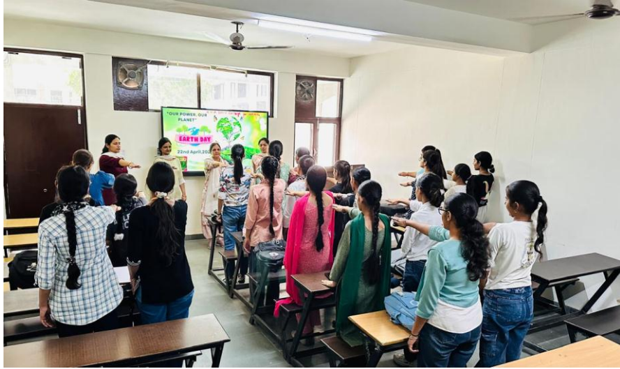
Students mark Earth Day by pledging action towards a sustainable future.