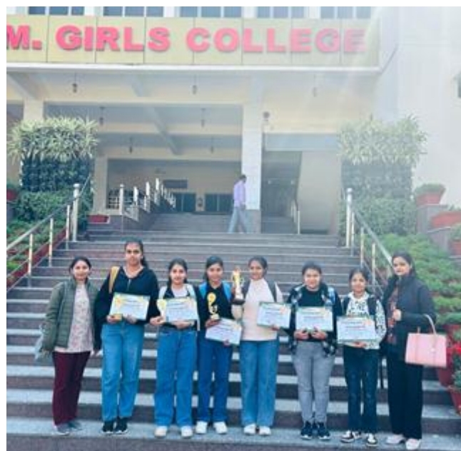
Winners of various events held at Geeta Vidya Mandir Girls College, Sonipat on February 28, 2025